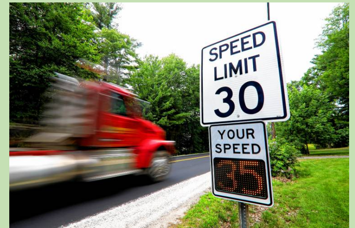
Speed feedback signs/etc.