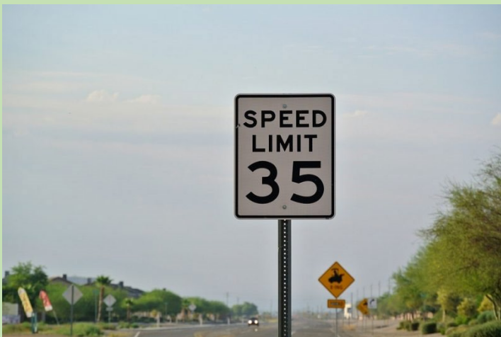
Speed limit changes/signage